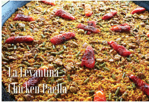
La Levantina Chicken Paella