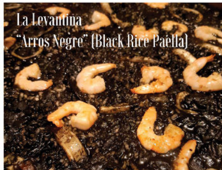
La Levantina "Arros Negre" (Black Rice Paella)