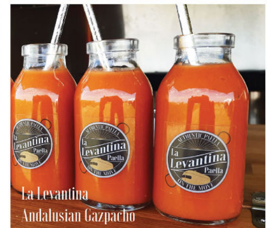
La Levantina Andalusian Gazpacho