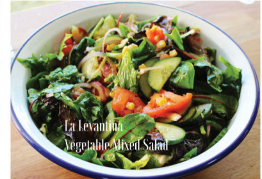
La Levantina Vegetable Mixed Salad