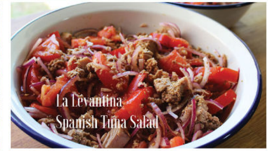
La Levantina Spanish Tuna Salad