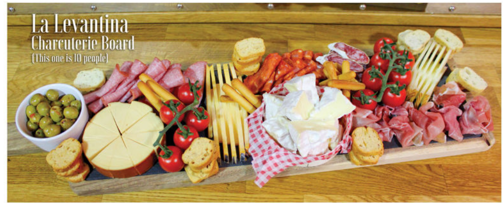
La Levantina Charcuterie Board (This one is 10 people)