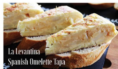
La Levantina Spanish Omelette Tapa