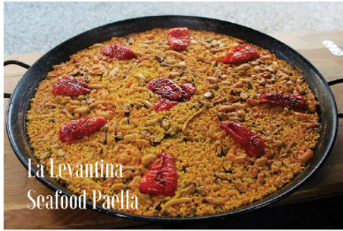
La Levantina Seafood Paella