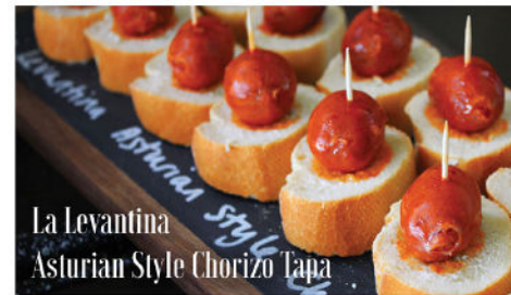
La Levantina Asturian Style Chorizo Tapa