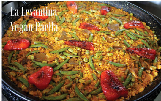
La Levantina Vegan Paella