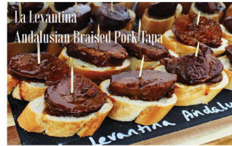
La Levantina Andalusian Braised Pork Tapa